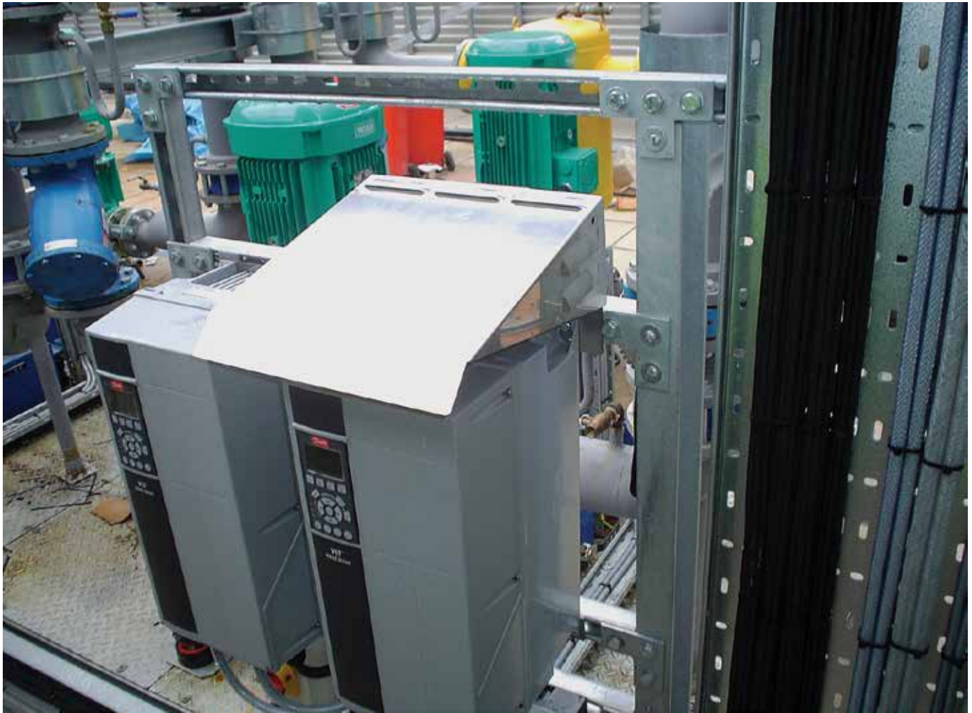
Danfoss FC series can withstand even the harshest pressure washing environments. A NEMA/UL Type 4X rated enclosure provides maximum mounting flexibility