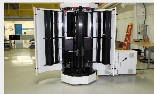
Cascading Storage Hotels (with removable option)